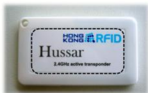
Recommended Label Dimension: 40.4mm x 18.4mm, Radian 0.8 (Front)