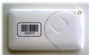
Recommended Label Dimension: 15.5mm x 9.6mm, Radian 0.8 (Back)